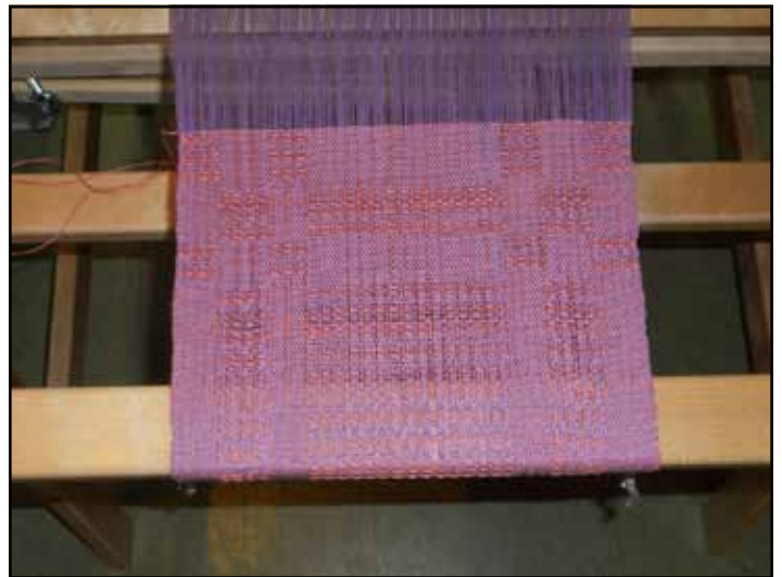
Eight-harness twill blocks are just one of the block weaves that will be drafted and woven during a two-day class at the Guild Hall in September. See page 8.

We would love to see photographs of YOUR handwoven creations or other textiles arts! To have your work included in a future issue of this newsletter, please send digital photographs, 900 pixels wide, to the editor at weaving_news@spokaneweavers.org or contact Kristie at a meeting if you have printed photographs.