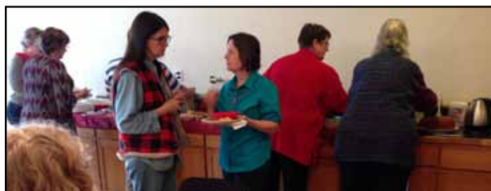
Lots of good friends and good food at SHG's annual holiday potluck on Dec. 7, 2014.