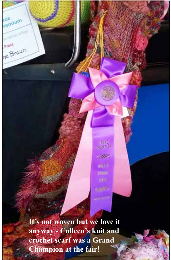
It's not woven but we love it anyway - Colleen's knit and crochet scarf was a Grand Champion at the fair!