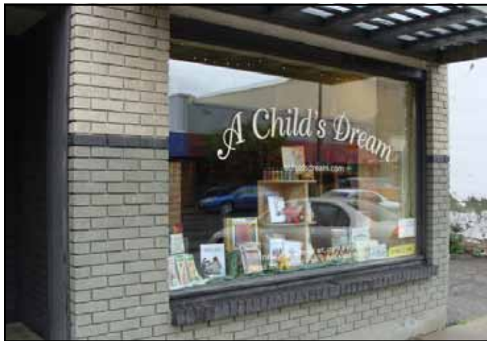
New SHG business member A Child's Dream offers a large array of fiber, natural fabrics and supplies for felting, nuno and spinning along with Jacquard dyes, yarn, Ashford products, wool felt, tools, kits, silk and more. Shop online at http://www.achildsdream.com/ or in downtown Sandpoint, ID at 214-A Cedar Street.

Or use your credit card to join online at www.spokaneweavers.org