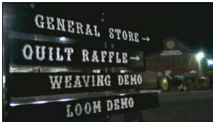
Judy set up a loom and demonstrated weaving at the fair!