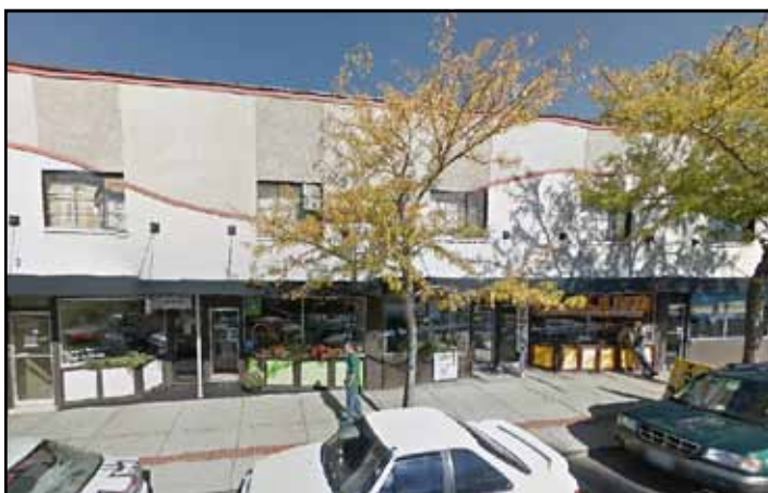
Above: SHG's new space at 606 W. Garland in northwest Spokane will accommodate meetings, classes, exhibits, sales and more!

Dedicated to increasing skill in and awareness of the art and craft of weaving by hand