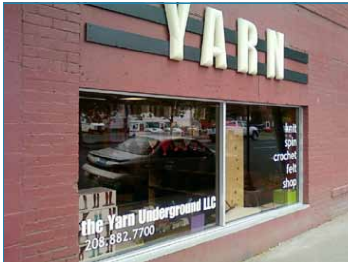
SHG business member The Yarn Underground offers squishy yarn, irresistible fiber, affordable tools, and most importantly, good help. Located in Moscow, ID at 409 S Washington Street. Visit them online at http://yarnunderground.com/