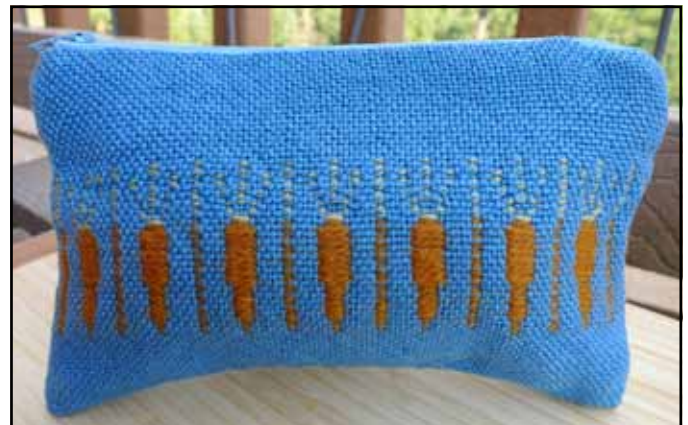
Below: Jen used a similar technique to weave a row of carrots on the fabric for her zippered bag.